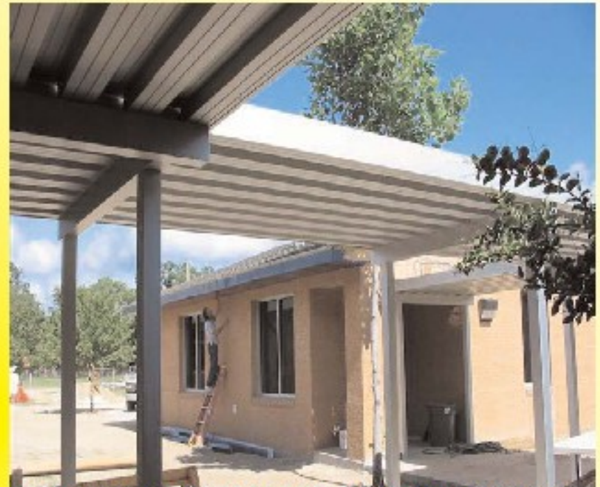
Construction workers prepare the SBHC at Scotlandville Elementary School, which is scheduled to open Jan. 2007.